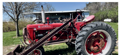
1954 International Super C