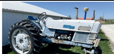
1962 Ford 6000