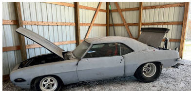
1969 Chevrolet Camaro