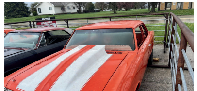
1967 Chevelle Malibu