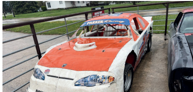
Pro Street Stock Car