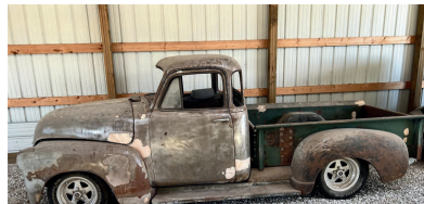
1952 Chevrolet Truck