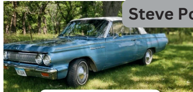
1963 Buick Special Convertible