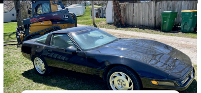
1994 Chevrolet Corvette, 57,000 miles