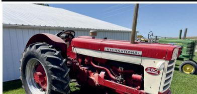
1962 International 660

Auction Preview - May 4th 10 a.m. - 2 p.m.