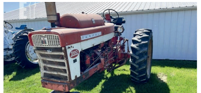
1960 International 560 LP

Auction Preview - May 4th 10 a.m. - 2 p.m.