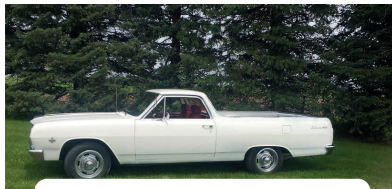
1965 Chevrolet El Camino, 66,000 miles