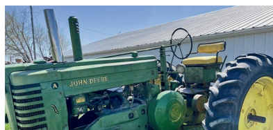
1949 John Deere A