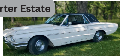
1964 Ford Thunderbird