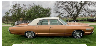
1967 Mercury Montclair, 91,000 miles