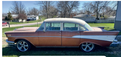
1957 Chevrolet Bel Air, 86,000 miles