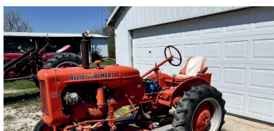
1953 Allis-Chalmers B