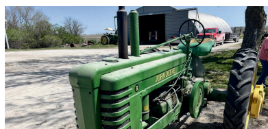
1936 John Deere B