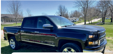
2015 Chevrolet Silverado 1500 HD LTZ, 48,000 miles

Auction Preview - May 4th 10 a.m. - 2 p.m.