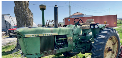
1966 John Deere 2510