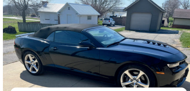
2015 Chevrolet Camaro 2SS Convertible, 34,000 miles