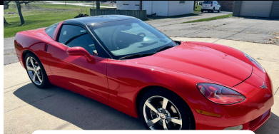
2010 Chevrolet Corvette LS3, 12,000 miles