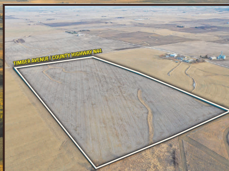
TRACT 3 | 80 ACRES M/L 79.45 FSA CROPLAND ACRES CSR2 SOIL RATING OF 88