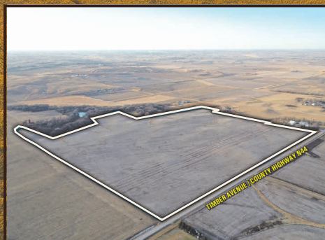
TRACT 5 | 144.09 ACRES M/L 139.71 FSA CROPLAND ACRES CSR2 SOIL RATING OF 79.9