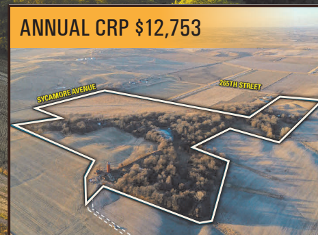
TRACT 8 | 143.4 ACRES M/L 55.69 FSA CROPLAND ACRES CSR2 SOIL RATING OF 66.7