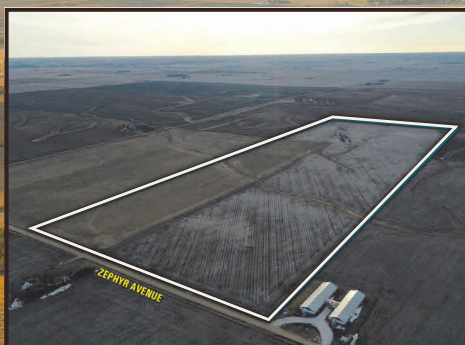
TRACT 2 | 120 ACRES M/L 119.27 FSA CROPLAND ACRES CSR2 SOIL RATING OF 86.1