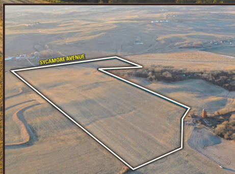
TRACT 7 | 51.46 ACRES M/L 48.26 FSA CROPLAND ACRES CSR2 SOIL RATING OF 79.8