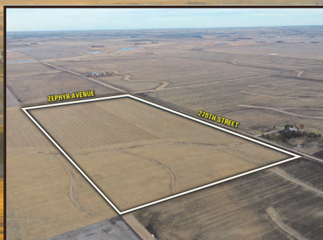
TRACT 1 | 80 ACRES M/L 76.43 FSA CROPLAND ACRES CSR2 SOIL RATING OF 84.1