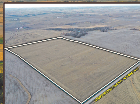
TRACT 4 | 97.24 ACRES M/L 94.86 FSA CROPLAND ACRES CSR2 SOIL RATING OF 87.6