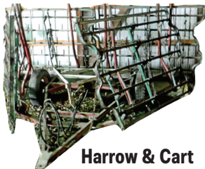
Harrow & Cart