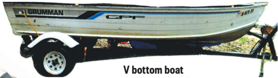
V bottom boat