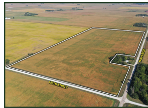
TRACT 3: 77.62 ACRES M/L 74.43 FSA cropland acres 84.3 CSR2