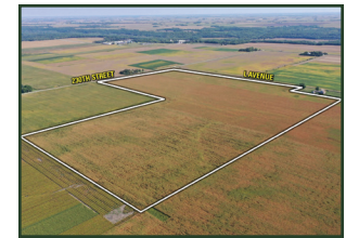
TRACT 6: 116.51 ACRES M/L 115.52 FSA cropland acres 88.2 CSR2