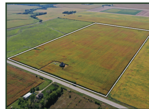
TRACT 10: 69 ACRES M/L 69.6 FSA cropland acres 87.4 CSR2