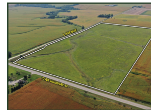
TRACT 11: 69.58 ACRES M/L Currently used as pastureland 85.1 CSR2