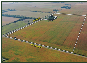
TRACT 2: 75 ACRES M/L 75.2 FSA cropland acres 86.8 CSR2