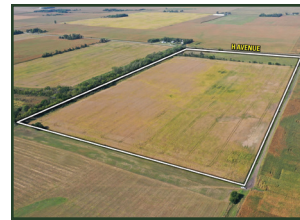
TRACT 4: 80 ACRES M/L 63.45 FSA cropland acres 82.4 CSR2