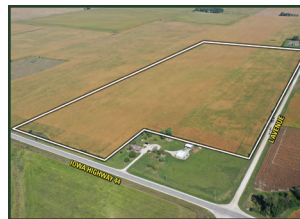
TRACT 9: 75 ACRES M/L 73.51 FSA cropland acres 88.5 CSR2