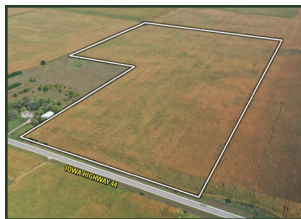
TRACT 8: 63.77 ACRES M/L 63.62 FSA cropland acres 88.4 CSR2