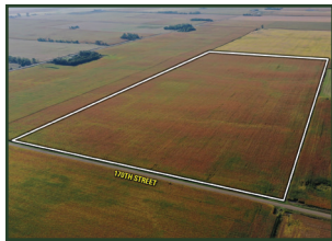
TRACT 1: 80 ACRES M/L 79 FSA cropland acres 87.9 CSR2

Tracts 1-5 are located southwest of Perry, and Tracts 6-12 are located west of Dallas Center. Online bidding is available via our mobile app!