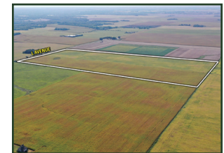
TRACT 12: 40 ACRES M/L 39.16 FSA cropland acres 88.4 CSR2