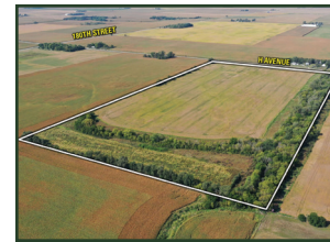
TRACT 5: 80 ACRES M/L 65.64 FSA cropland acres 85.8 CSR2