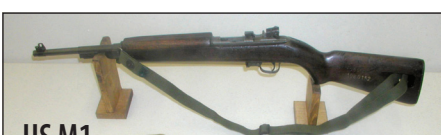
US M1 Carbine