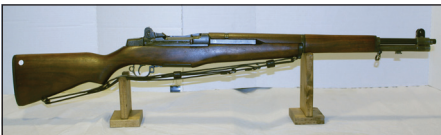
M1 Garand, May 1941, "Lend Lease", totally correct with British stamps

Younger Auction Gallery, 312 E. South Hills Dr., Maryville, MO