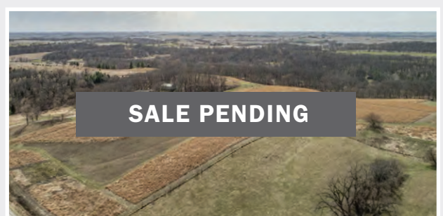
Poweshiek County // 20± Acres Executive building site 3 miles from I-80