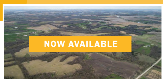
Marion County // 356± Acres Hunting land with great income; Building sites