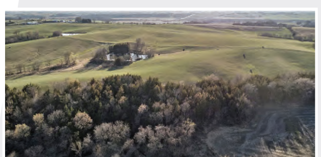
Union County // 55± Acres Building site on pavement; Pond; Hunting