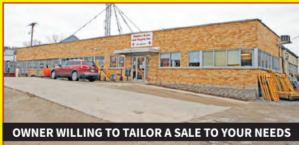
OWNER WILLING TO TAILOR A SALE TO YOUR NEEDS

After 65 years in this industry I'm looking for someone to pass the torch to!