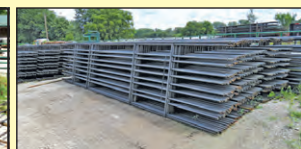
CONTINUOUS FENCE PANELS STARTING AT $80

CALL FOR LOAD PRICE CUSTOM ALLEYS & TUBS