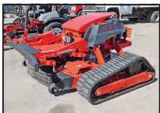
GQ9965 Remote Mowers TRX-48-PRO ZTR slope mower

INVENTORY INCLUDES: pickup trucks, SUVs, passenger and classic vehicles, dump trucks, utility vehicles, trolley, tractors, wood chipper, shuttle buses, equipment trailers, flatbed trucks and more. All items are sold "AS IS." 10% buyers premium applies.