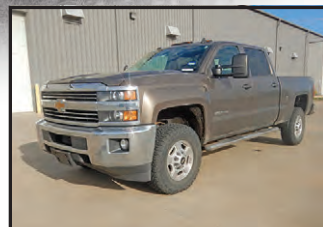
HG9676 '15 Chevy Silverado 2500HD Crew Cab pickup truck