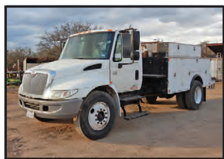
DM2864 '07 Int'l 4300 utility/service truck