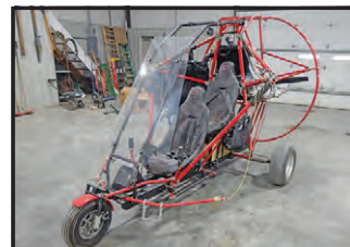
HO9331 '05 Infinity power parachute