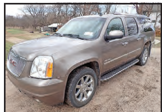
DJ0217 '12 GMC Yukon Denali SUV