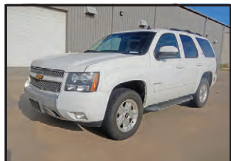
HG9677 '13 Chevy Tahoe SUV