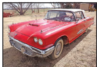
DJ0194 '59 Ford Thunderbird convertible