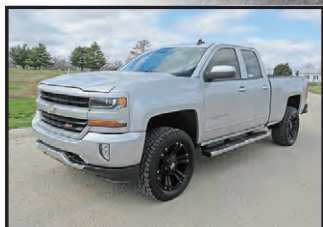
HV9711 '16 Chevy Silverado 1500 LT Crew Cab pickup truck