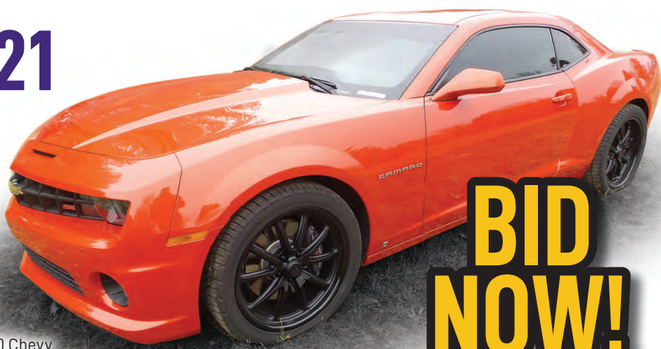
HF9831 '10 Chevy Camaro SS