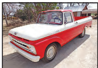
DJ0196 '61 Ford F100 pickup truck