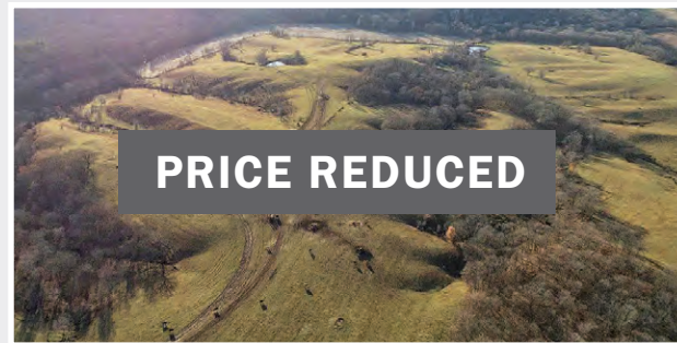
Lucas County // 210± Acres Income potential; 2 ponds; Great hunting