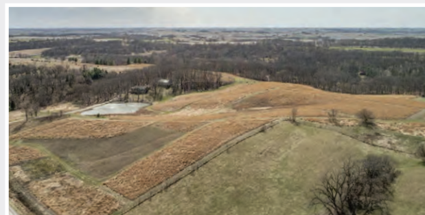
Poweshiek County // 20± Acres Executive building site 3 miles from I-80