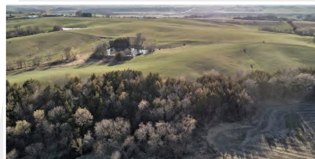
Union County // 55± Acres Building site on pavement; Pond; Hunting