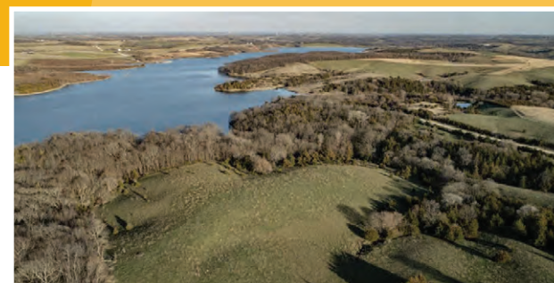
Union County // 34± Acres Next to 12 Mile Lake, Stocked pond, Hunting