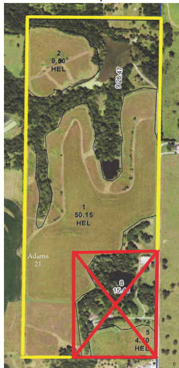
Adams Township Section 21