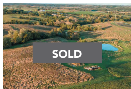
Dallas County // 40 ± Acres