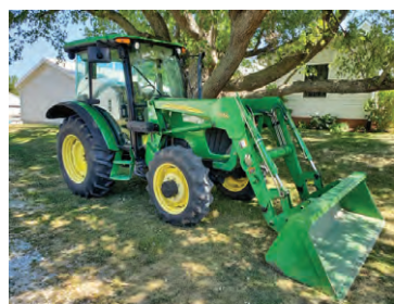
2005 J.D. 5425 MFWD tractor, cab, AC, heat, 955 actual hours w/J.D. 542 loader, 7' bucket

SALE ORDER: HOUSEHOLD, TOOLS, MISCELLANEOUS, MACHINERY AND TRACTORS