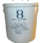
Red Wing Crock