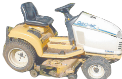
Cub Cadet 2165