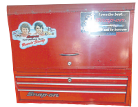
Snap-On Tool Chest