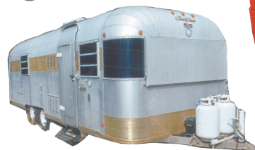
Atlas "Silver Streak" Camper