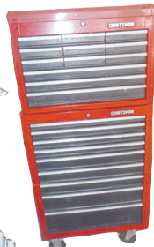
Craftsman Tool Chest